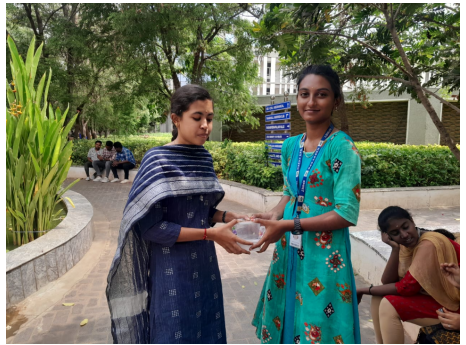
Click to View