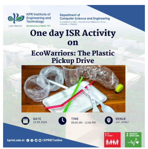
Click to View